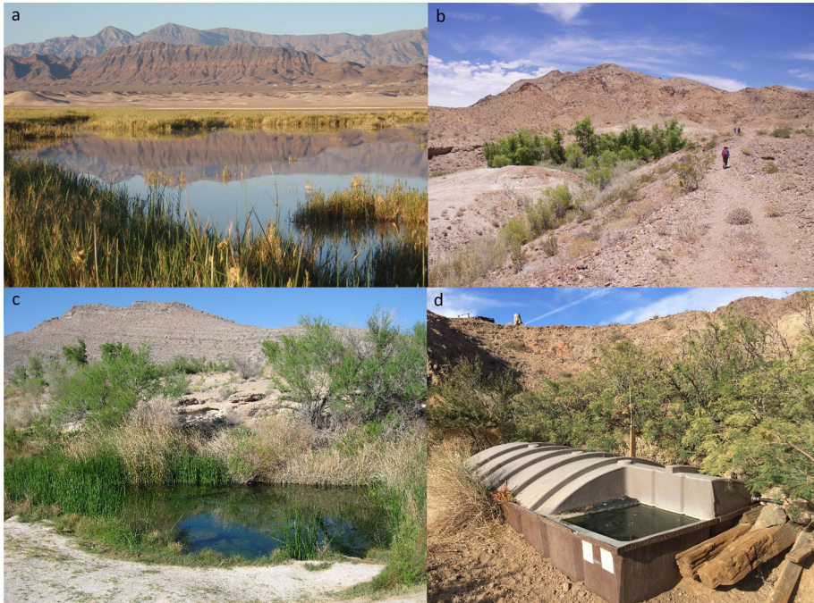
Fig. 2 Photographs of Mojave Desert springs. Borax Spring (a) and Bonanza Spring (b), are located in the California portion of the Mojave Desert, whereas Point of Rocks Spring (c), is part of a large spring complex in Ash Meadows National Wildlife Refuge in Nevada. The flow from Stone Canyon Spring (d) has been directed into a guzzler used by wildlife.