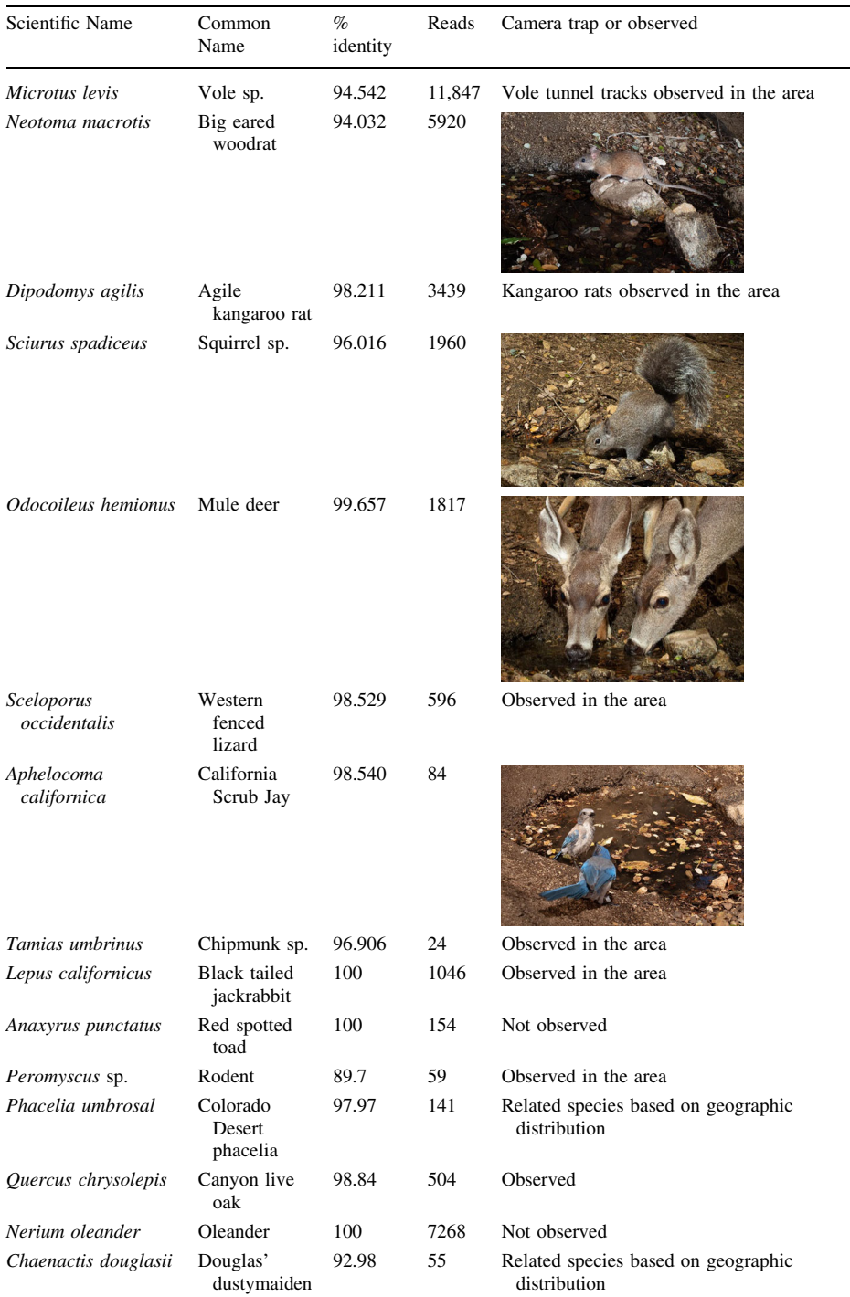
Table 2 Vertebrate and plant species detected from water samples at Ahn Springs using eDNA techniques, compared with camera trap or field observations